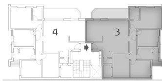
דירה 4 היא תמונת ראי של דירה 3

בניין 10 קומה 1 5 חדרים + מרפסת שטח דירה 108 מ"ר שטח מרפסת 8.8 מ"ר