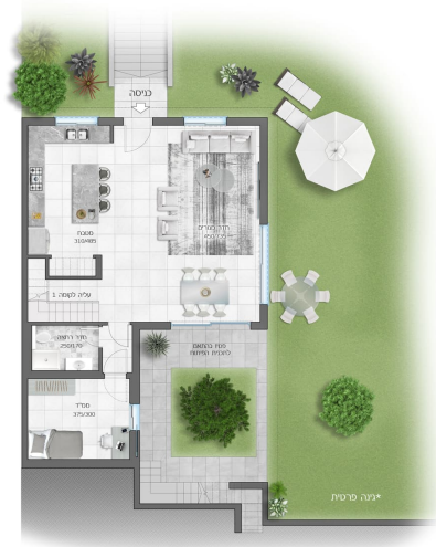
יגנה פרטית בהתאם להזנת פירוט

דגם שור קומת קרקע 5 חדרים + יגנה פרטית + מרפסת שטח דירה 158 מ"ר