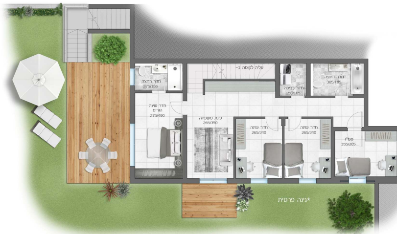
*גינה פרטית בהתאם לתכנית פיתוח

דגם ירקון קומה -2 6 חדרים + *גינה פרטית + מרפסת שטח דירה 160 מ"ר