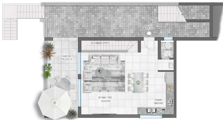
*גינה פרטית בהתאם לתכנית פיתוח

דגם ירקון קומה -1 6 חדרים + *גינה פרטית + מרפסת שטח דירה 160 מ"ר